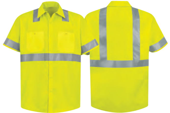
Available in yellow