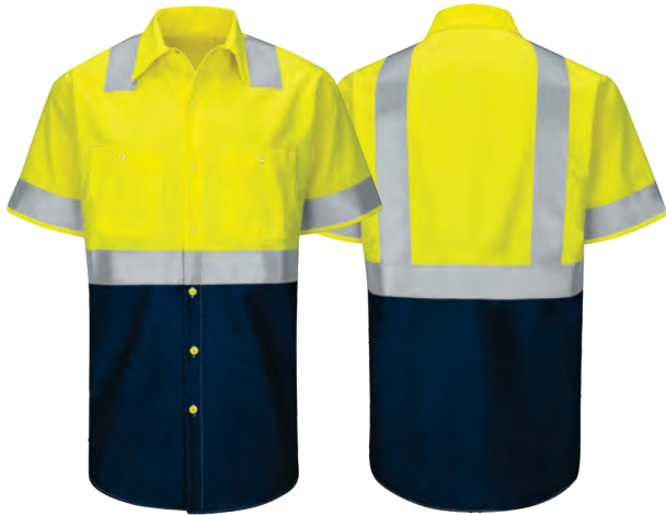
Available in yellow/navy