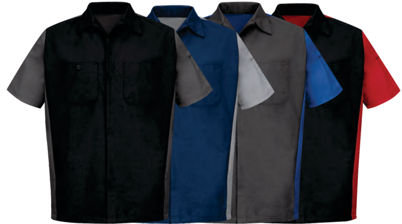
black/charcoal navy/gray charcoal/blue red/black